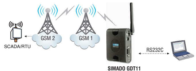
SIMADO GDT11 in Data Acquisition Application

Matrix SIMADO GDT11 can be deploy for online data, acquisition SCADA, Remote login, monitoring and controlling devices. Remotely working device data like level, temperature, pressure, flow, density etc., can be captured in real time using SIMADO GDT11.